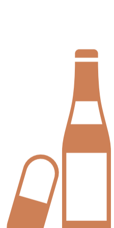
Alcohol or Drug Use